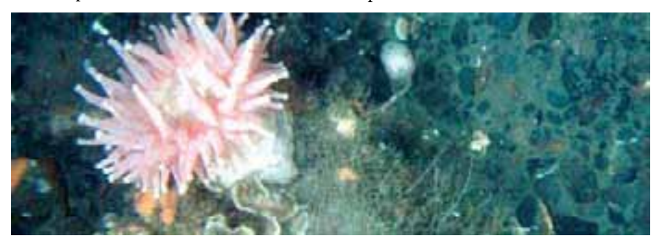
This picture is one of 200,000 pictures taken during the 2008 R/V Pandalus survey south of St. Lawrence Island. Shown is an anenome.

The NSFR&D Program has continued to grow over the years. During the 2008 season, Kawerak Inc. decided to trim their fisheries program and turned back funding that was offered to assist in the operation of three salmon counting weirs. NSEDC assumed the operation of the Pilgrim River weir and Fish and Game assisted in the operation of both the Eldorado and Snake River weirs. Fish and Game's assistance was greatly appreciated, especially given the short notice that NSFR&D would continue to operate the weirs.