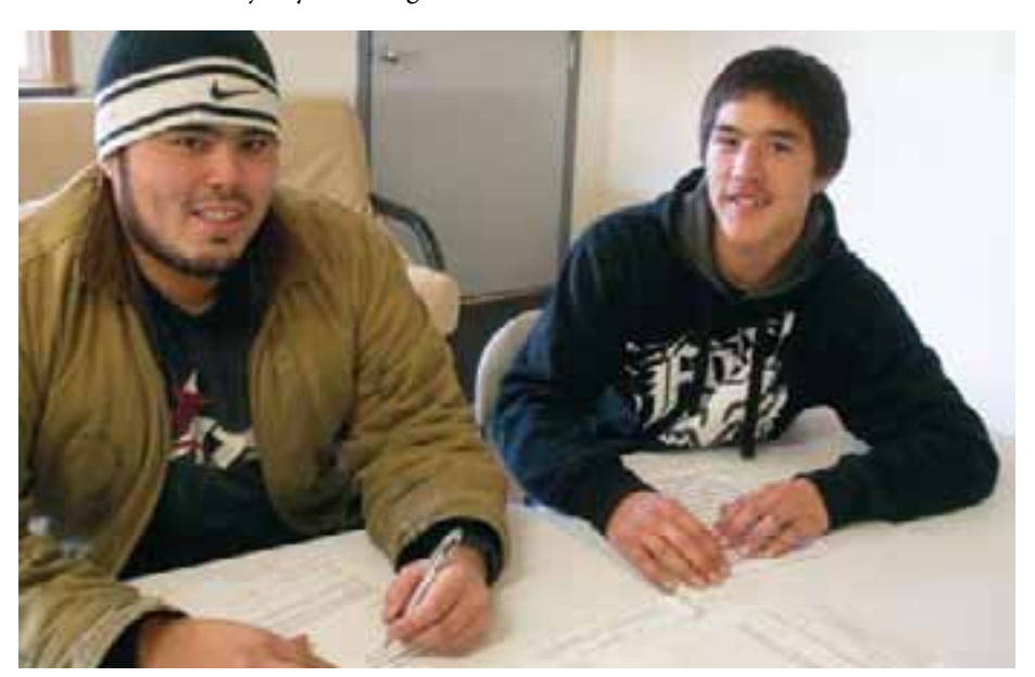
In 2008 the NSEDC Board approved a one-time $500 energy subsidy to all qualifying Norton Sound households. In total $1,184,000 was paid to 2,368 electric utility accounts.

The Board of Directors is confident that this program helped ease the immediate burden of rising energy costs affecting the region, but acknowledged that this is a one-time subsidy and a short-term solution and directed staff to examine long-term solutions.