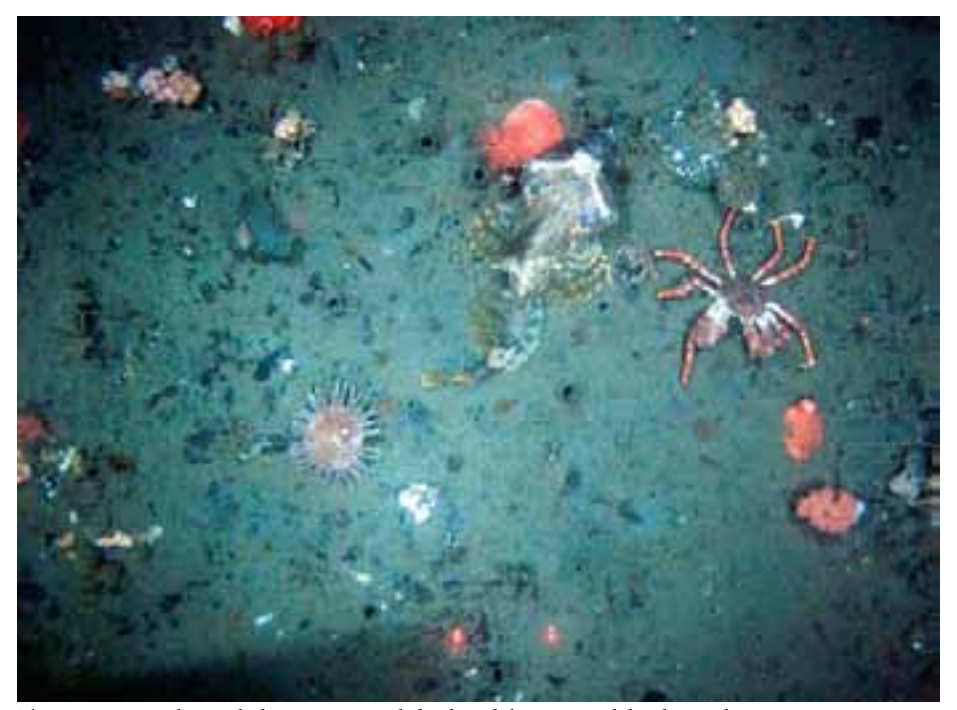
This picture was taken with the new camera sled onboard the R/V Pandalus during the 2008 ADF&G and NSFR&D survey south of St. Lawrence Island. Shown are a sculpin, lyre crab and several other bottom creatures.

funded supplementary seasonal staffing and research efforts to address salmon management. One of our goals has been to have escapement projects on representative salmon stocks and rivers throughout the region. NSEDC supports supplemental technicians on projects operated by the Alaska Department of Fish and Game, operating several projects using State protocols to ensure Fish and Game has the needed information to effectively manage local fisheries. We are now working to develop better indices of survival and return by counting the number of juvenile salmon transitioning to saltwater. The three species that rear in fresh water for multiple years are often more affected by habitat and food conditions in their juvenile years than the number of adults that were able to spawn. The two coho salmon smolt projects in the Nome and Fish River are showing promising results as potential management tools. Likewise, the investigations of sockeye salmon and the effects of fertilizer are a means of setting escapement needs and boosting sockeye production.