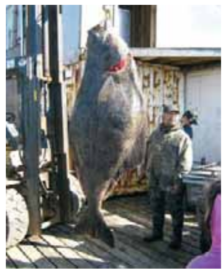
Savoonga fishermen bring these huge halibut in using open skiffs. In 2008 they delivered 23,976 pounds to the Savoonga plant.

Eight fishermen participated in the 2008 winter crab fishery. 12,293 pounds were delivered. The total paid to fishermen was $36,899.