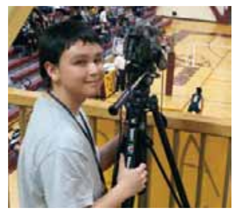
Students from the Bering Straits School District did live broadcasts from several sporting events with funds donated through NSEDC's 2008 Outside Entity Funding.