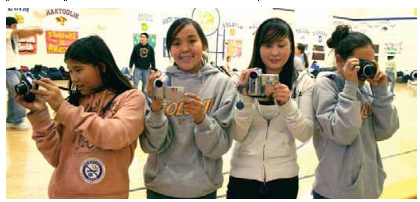
NSEDC funded BSSD $14,200 for their State Championship Broadcasting project. The students did an excellent job. Residents who were unable to attend these sporting events appreciated the opportunity to see them live.

Purchased for NSSP operations and installed and operating in 2008, the new ice machine improves the efficiency and quality of the Southern Norton Sound fisheries.