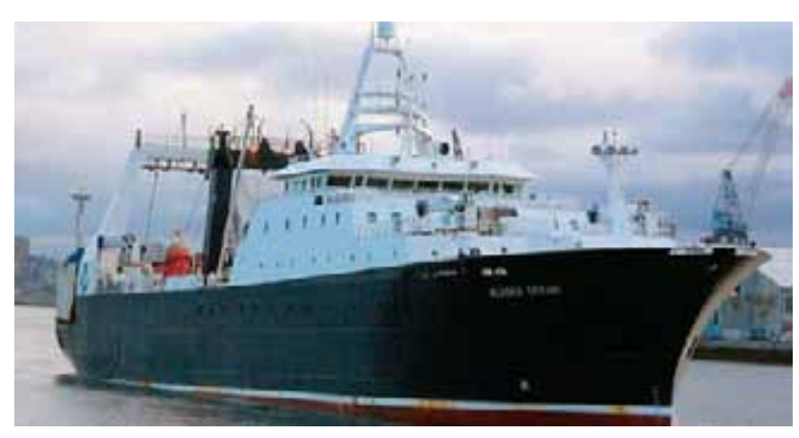
In June 2008, GFC finalized the acquisition of Alaska Ocean Seafoods (AOS) which owns the F/V Alaska Ocean, a 376 foot vessel, the largest pollock fishing vessel in the US fleet and overall, a very complementary addition to the GFC organization.

Another significant event for GFC was the acquisition of the F/V Alaska Ocean and welcoming Nissui USA as a partner. Measuring 376 feet, the F/V Alaska Ocean is the largest harvesting platform in the United States. The purchase almost doubled GFC's pollock holdings to 6.22 percent of the Bering Sea