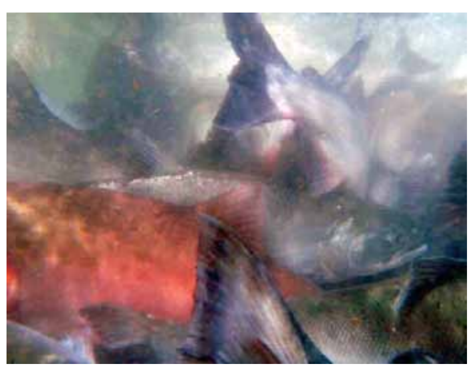
This underwater glimpse of adult coho salmon was taken in the Nome River where NSFR&D had a salmon smolt project, one of their many salmon restoration projects during the 2008 season.

Local fisheries and the respective management are of great importance to regional residents and the NSEDC Board. The Norton Sound region has rarely had state-supported research staff, in contrast to the management districts to the south. The NSEDC Board realized this and has