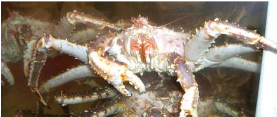
Norton Sound red king crab in a holding tank for live sales at the Norton Sound Seafood Center in Nome.

The NSSC retail operations and sales increased in 2003 compared to 2002, the year that NSSC began initial operation. Retail sales totaled $147,153. The NSSC purchases fresh, frozen, canned and value-added products from seafood producers outside the region. The retail store is a welcome addition to Nome and the region.