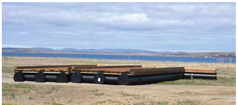
Golovin floating dock waiting to be launched.

The floating dock is designed as five modular sections and constructed of high-density polyethylene pontoons filled with foam and the decking of the dock is made of all weather wood. The dock sections will be connected together by bolting each end section to one another and held in place by an anchor system. The City of Golovin will acquire ownership and all responsibility to operate, maintain, launch, remove and store the floating dock once the initial launching and placement of the dock is complete.