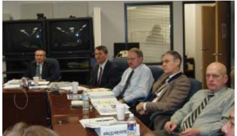
Members of the CDQ Team at the Public Hearing held in November 2004

The initial allocations for pollock and other fish species in the Community Development Quota (CDQ) Program were announced for the 2006-2008 cycle in February. These allocations result in payments to NSEDCC for use in funding our programs and projects, as well as investments.