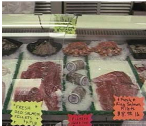
Display case at the Norton Sound Seafood Center