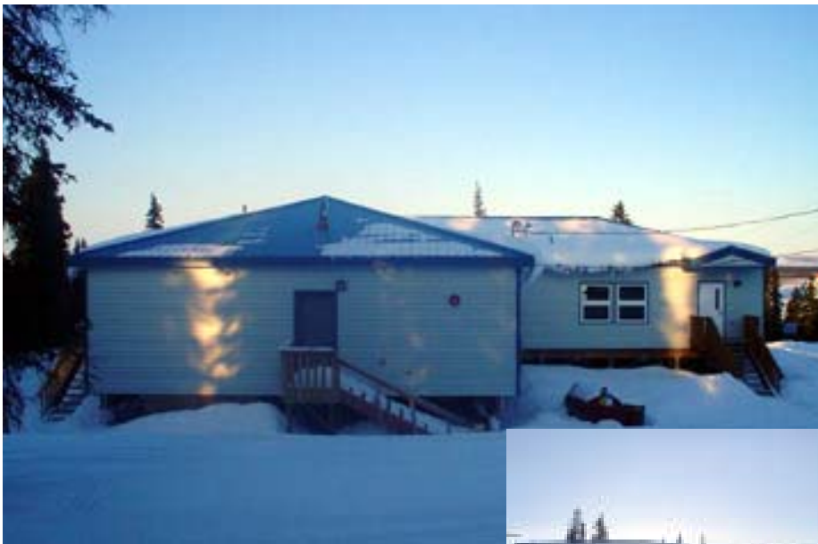
White Mountain Multi-Purpose Building

The multi-purpose buildings in both communities are completed to a level of occupation and use. The funds received from NSEDC will be used to bring construction through its final stages, improve landscaping, and purchase building equipment. The multi-purpose buildings provide office space, headstart/day care facilities, sleeping quarters, and large multi-purpose rooms for community gatherings and meetings.