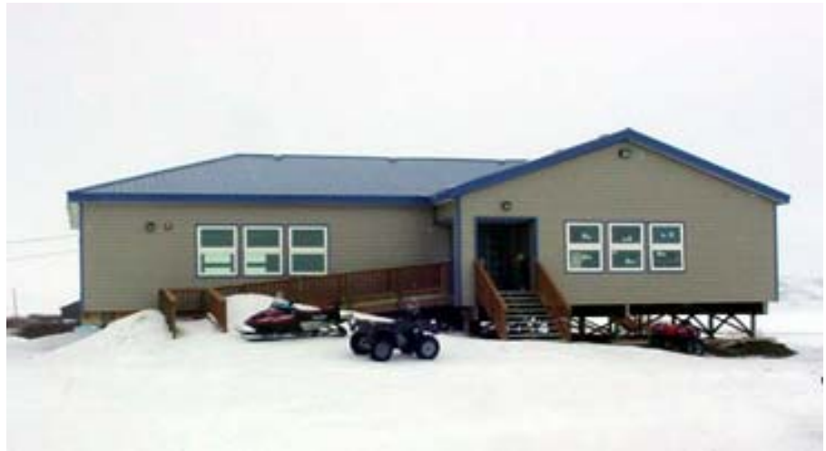
Golovin EDA Multi-Purpose Building

In March of 2003, Norton Sound Economic Development Corporation received requests from the Native Village of White Mountain and Chinik Eskimo Community to provide financial assistance for the construction of a multi-purpose building in White Mountain and