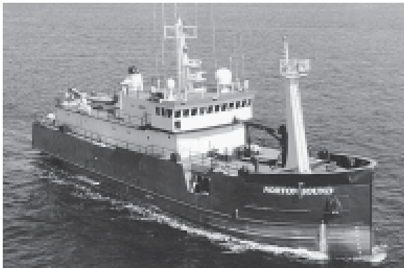
F/V Norton Sound