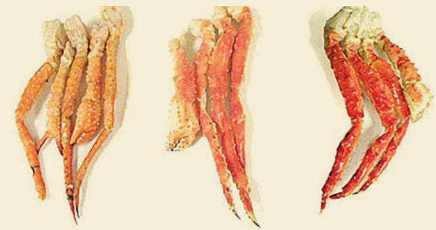
Brown (also known as golden), Blue and Red King Crab.

NSEDC worked with the catch-processing vessel F/V Baranof , and the catcher vessels F/V Ocean Olympic and F/V North Sea to harvest the entire 2006/07 quota of 658,188 pounds of CDQ opilio crab. The Baranof is an at-sea catcher/processor which by regulation can take only 75% of the allocation in any CDQ crab fishery with the remaining 25% required to be delivered to and processed by a shoreside plant. This