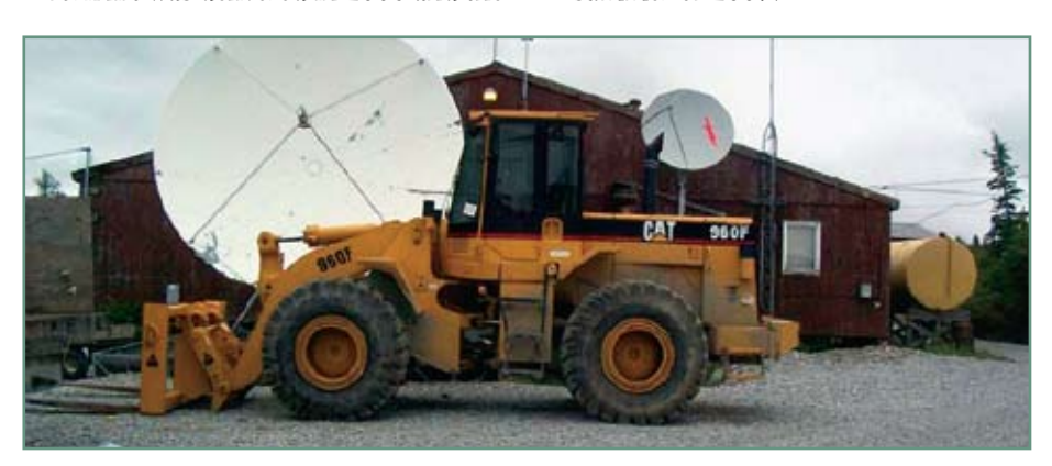
Front end loader purchased in lieu of boat ramp for Koyuk