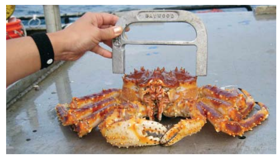
2006 Northern Bering Sea Trawl Survey - 5.5 inch blue king crab

In April, NSEDC acquired the research vessel Pandalus from ADF&G. Under a cooperative agreement with ADF&G the vessel was brought to Norton Sound in July to conduct two trawl surveys. ADF&G conducted the Triennial Norton Sound Red King Crab Trawl