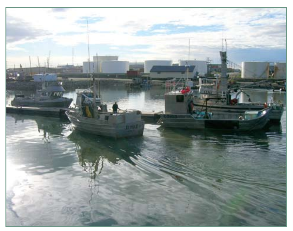
Boats docking at the Nome Small Boat Harbor

In 2006, NSEDC made four Large Vessel Loans in the sum of $168,875.64 to local commercial fishermen of Elim, Nome and Shaktoolik.