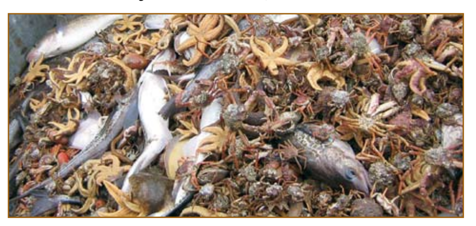
2006 Northern Bering Sea Trawl Survey - catch at one of the stations

NSFR&D also continued work with LGL Alaska Research Associates Alaska on Nome River juvenile coho studies. We're looking at how juvenile salmon utilize habitat, how many fish are actually needed to provide stable returns, and how well salmon survive in their time at sea. We are planning to expand this project to other river systems in the near future to provide for better management of coho stocks around the region.