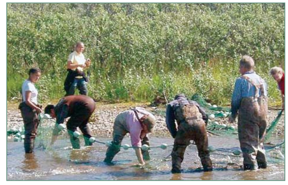
Trying to find the best fish for egg takes

During the last five years, the sockeye salmon returns to Salmon Lake have blossomed. Unfortunately the size of sockeye smolt leaving the lake has declined to the levels seen over ten years