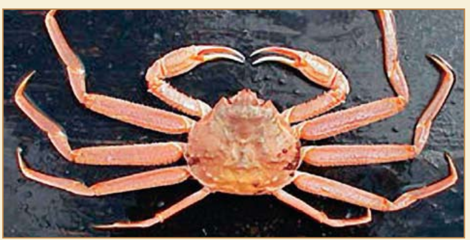
Opilio Crab (Chionoecetes bairdi)

NSEDC harvested the entire amount of the 2006/07 allocation of CDQ bairdi crab or 33,750 pounds in the eastern district and 19,692 pounds in the western district using the F/V Baranof and the F/V Tempo Sea . This quota was harvested in a timeframe from December 2006 to April 2007.