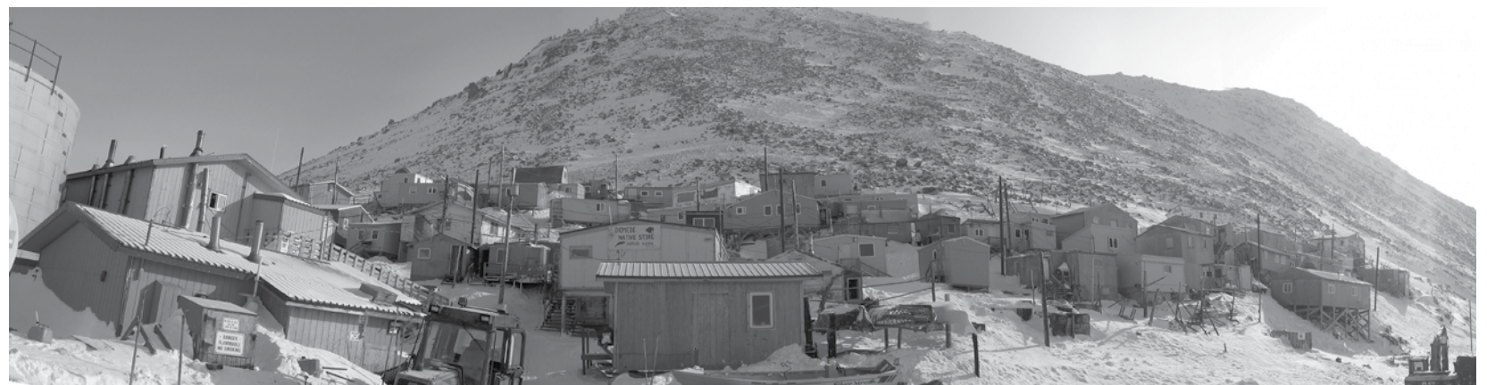
Community of Diomede