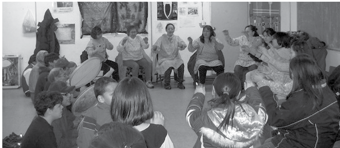
NSEDC was honored with an evening of Eskimo dancing and singing