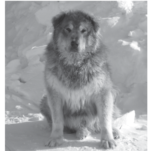
Clifford, one of NSEDC's guides on the International Dateline tour