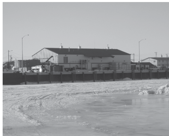
View of Norton Sound Seafood Center from the frozen small boat harbor