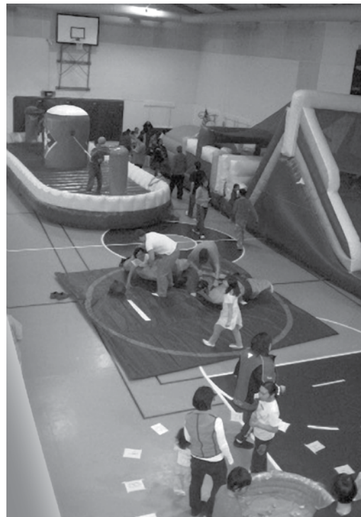
Five of the activities at the Diomedede Fishermen's Fair

NSEDCC staff was also invited to join the after-school ski program, and a few friendly community dogs, to walk out on the ice between the two islands and across the International Dateline, traveling into tomorrow. It was a gorgeous sunny day with only a little wind. The expedition included ski races amongst the students.