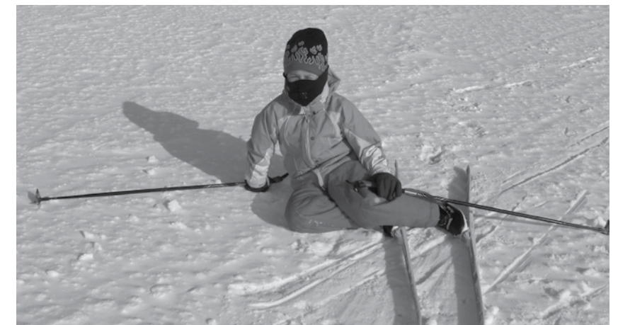
Little girl taking a break on the ski trip