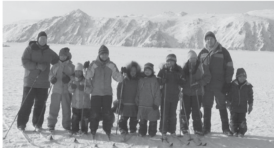
After School Ski Program participants and NSEDC guides