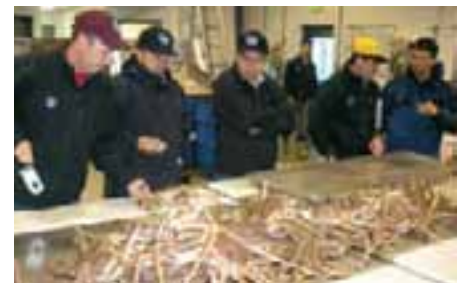
NSEDC invited Nissui representatives to visit the Norton Sound region and introduced them to our fishery resources, products and processing techniques.