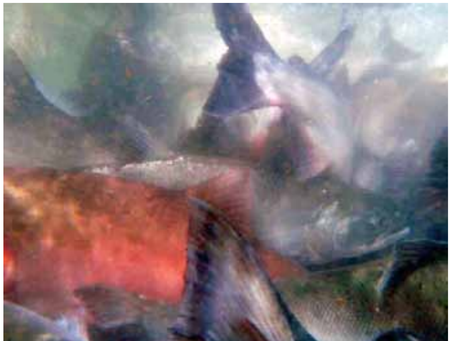
This underwater glimpse of adult coho salmon was taken in the Nome River where NSFR&D had a salmon smolt project, one of their many salmon restoration projects during the 2008 season.

Local fisheries and the respective management are of great importance to regional residents and the NSEDC Board. The Norton Sound region has rarely had state-supported research staff, in contrast to the management districts to the south. The NSEDC Board realized this and has