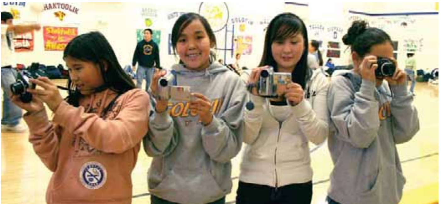
NSEDC funded BSSD $14,200 for their State Championship Broadcasting project. The students did an excellent job. Residents who were unable to attend these sporting events appreciated the opportunity to see them live.

Purchased for NSSP operations and installed and operating in 2008, the new ice machine improves the efficiency and quality of the Southern Norton Sound fisheries.