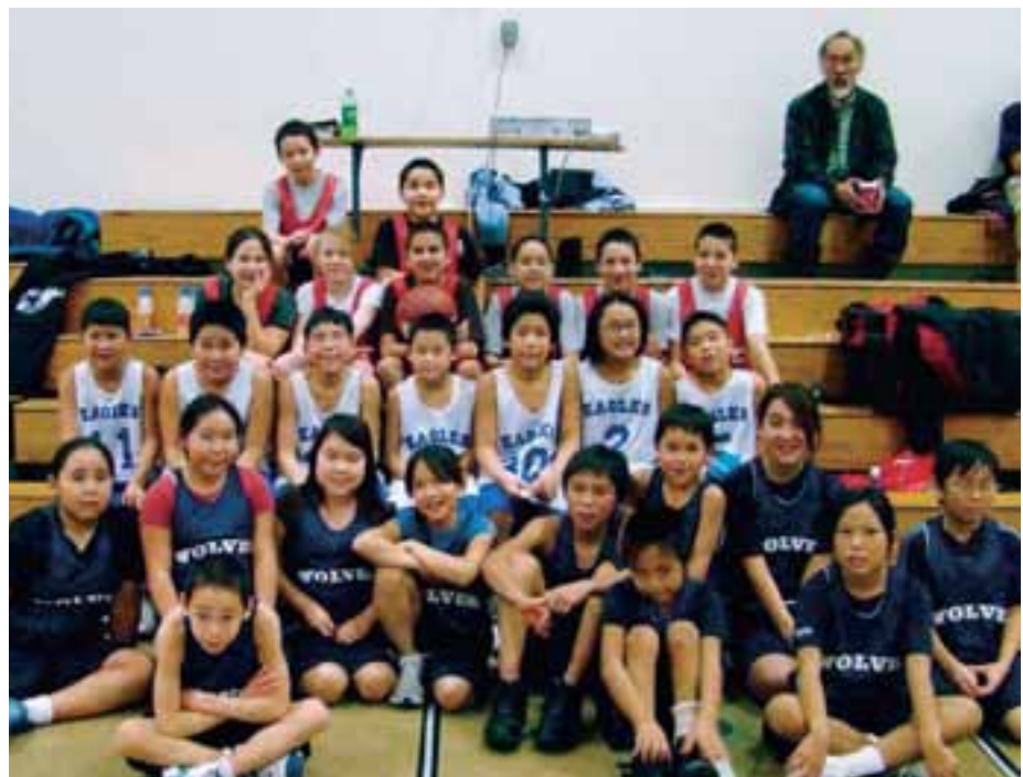
Elementary basketball programs in NSEDC's fifteen member communities and Shishmaref received $3,000 in funding through NSEDC's Little Dribbler Program.

The Little Dribblers Program was administered in each of the fifteen member communities and Shishmaref for the third consecutive year. As part of NSEDC's Substance Abuse Prevention Program, NSEDC donates $3,000 to the elementary school basketball programs. Basketball is a favorite activity in the Norton Sound, not only promoting physical fitness, but also providing a healthy