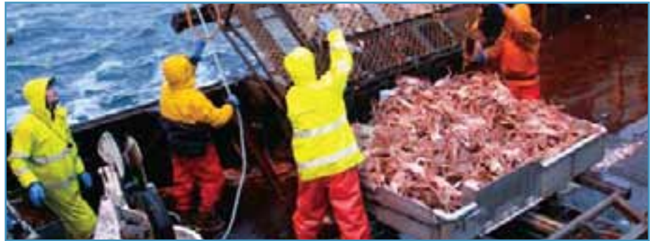
In 2008 the F/V Aleutian No. 1 harvested 1.2 million pounds of golden king crab, making it one of the top earners in the entire crab fleet. Two Norton Sound residents worked on board the F/V Aleutian No. 1 in 2008.

The NSEDC Scholarship Committee awarded scholarships to Norton Sound residents totaling $198,901 in the first quarter; $36,859 in the second quarter; $261,501 in the third quarter; and $16,000 in the fourth quarter for a total of $513,261 in 2008. Thanks to the NSEDC Board of Directors for providing an all time high number of scholarship awards to our