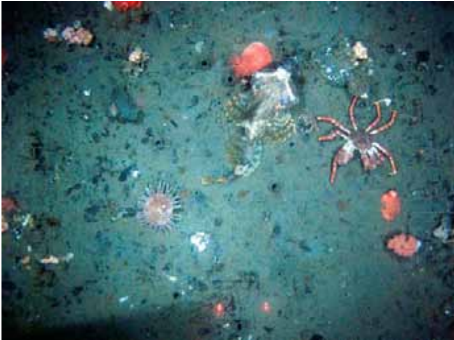
This picture was taken with the new camera sled onboard the R/V Pandalus during the 2008 ADF&G and NSFR&D survey south of St. Lawrence Island. Shown are a sculpin, lyre crab and several other bottom creatures.

funded supplementary seasonal staffing and research efforts to address salmon management. One of our goals has been to have escapement projects on representative salmon stocks and rivers throughout the region. NSEDC supports supplemental technicians on projects operated by the Alaska Department of Fish and Game, operating several projects using State protocols to ensure Fish and Game has the needed information to effectively manage local fisheries. We are now working to develop better indices of survival and return by counting the number of juvenile salmon transitioning to saltwater. The three species that rear in fresh water for multiple years are often more affected by habitat and food conditions in their juvenile years than the number of adults that were able to spawn. The two coho salmon smolt projects in the Nome and Fish River are showing promising results as potential management tools. Likewise, the investigations of sockeye salmon and the effects of fertilizer are a means of setting escapement needs and boosting sockeye production.