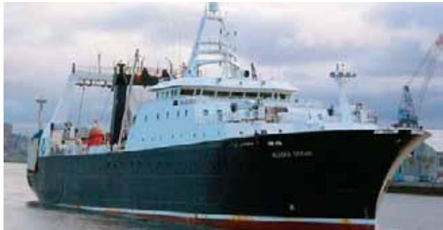
In June 2008, GFC finalized the acquisition of Alaska Ocean Seafoods (AOS) which owns the F/V Alaska Ocean, a 376 foot vessel, the largest pollock fishing vessel in the US fleet and overall, a very complementary addition to the GFC organization.

Another significant event for GFC was the acquisition of the F/V Alaska Ocean and welcoming Nissui USA as a partner. Measuring 376 feet, the F/V Alaska Ocean is the largest harvesting platform in the United States. The purchase almost doubled GFC's pollock holdings to 6.22 percent of the Bering Sea