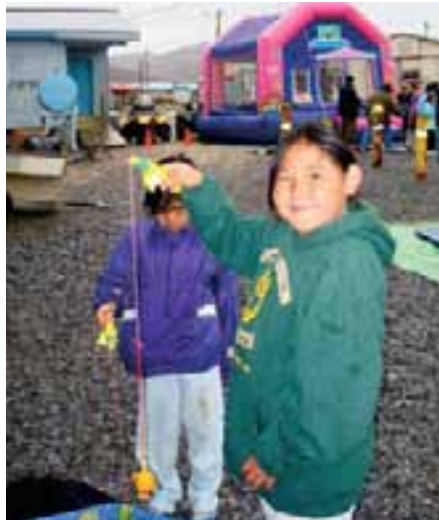
NSEDC hosted the 2008 Fishermen Fairs in Wales, Brevig Mission and Teller. As always we brought a lot of fun activities, great food and door prizes. These are held to honor local commercial and subsistence fishermen.

regional airlines round-trip tickets and freight, and NSEDC regalia.