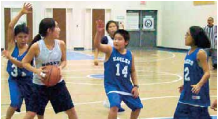
As part of our Substance Abuse Prevention Program, NSEDC donated $3,000 for the third year to elementary school basketball programs.

In response to the dramatic increase in energy costs in 2008, the Board of Directors approved a one-time subsidy to assist residents of its member communities in meeting those increased costs. The idea was introduced at the 2008 2nd quarter Board of Directors meetings and the Board