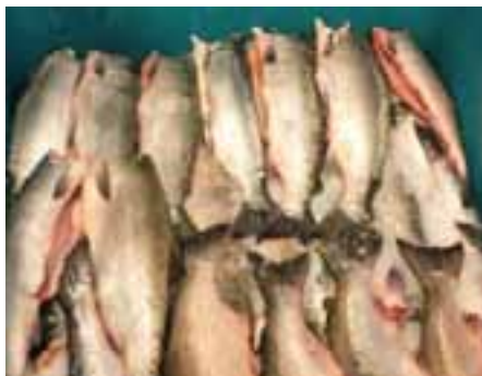
Southern Norton Sound fishermen delivered a total of 862,216 pounds of salmon. With their post-season settlement salmon fishermen were paid $1,023,465

A late opening this year limited the number of sockeye (red) salmon caught. Two fishermen made deliveries during this season.