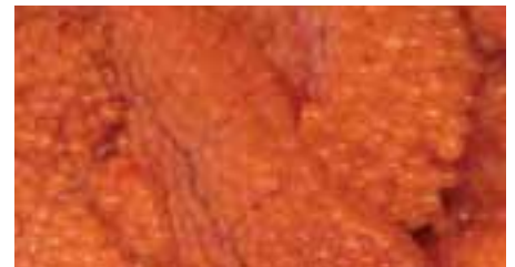
Southern NSSP processes whole skeins of fresh salmon eggs to be sold to markets.

Southern Norton Sound had another good fishing season. Operations started in late May with bait herring. Ninety tons were harvested by nine fishermen. Total value to the fishermen was $54,397.50.