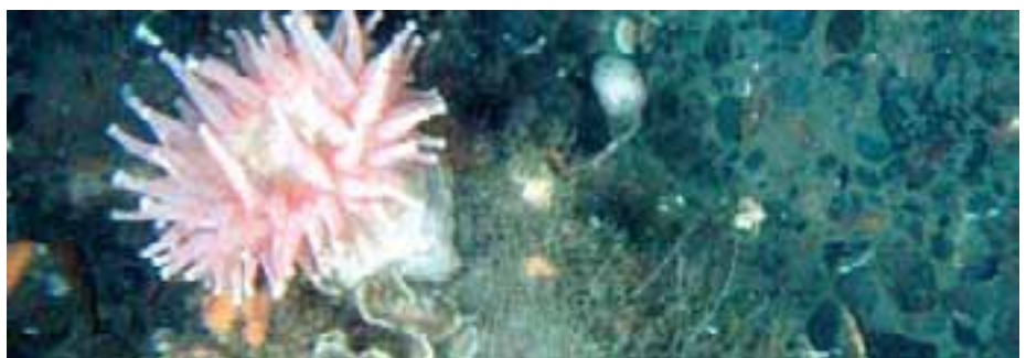
This picture is one of 200,000 pictures taken during the 2008 R/V Pandalus survey south of St. Lawrence Island. Shown is an anemone.

During the 2008 season, the triennial Norton Sound red king crab survey occurred as scheduled. NSFR&D cooperated with Fish and Game to survey portions of the northern Bering Sea using a new camera sled and the R/V Pandalus as the survey vessel. Some excellent photo transects were collected