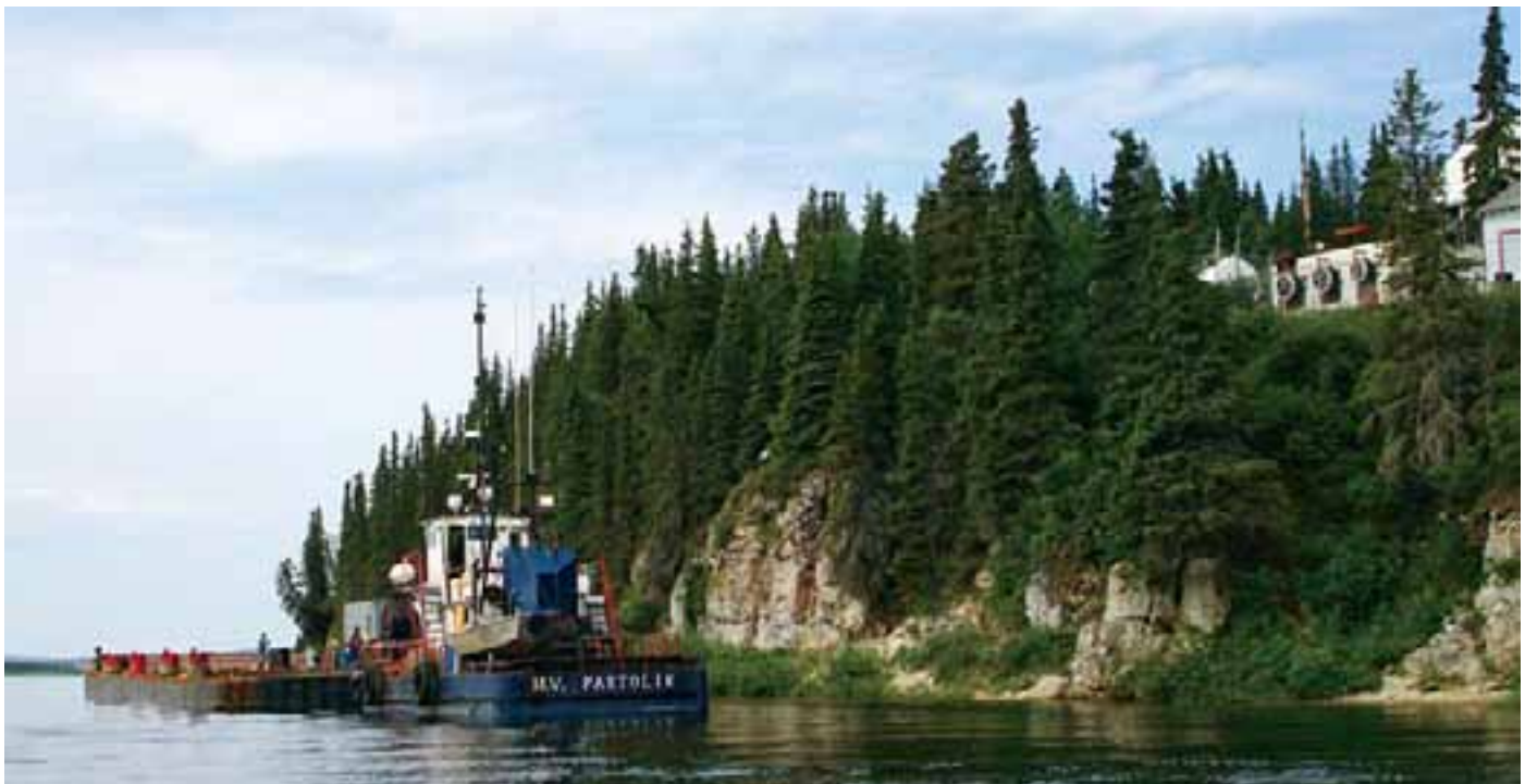
Delta Western was the Consolidated Bulk Fuel vendor for 2008. They are shown here making a delivery to White Mountain. Twenty-one participants from fourteen communities received 929,802 gallons of Diesel #1 Heating Fuel and 287,926 gallons of Unleaded Gasoline. (see article on page 8)