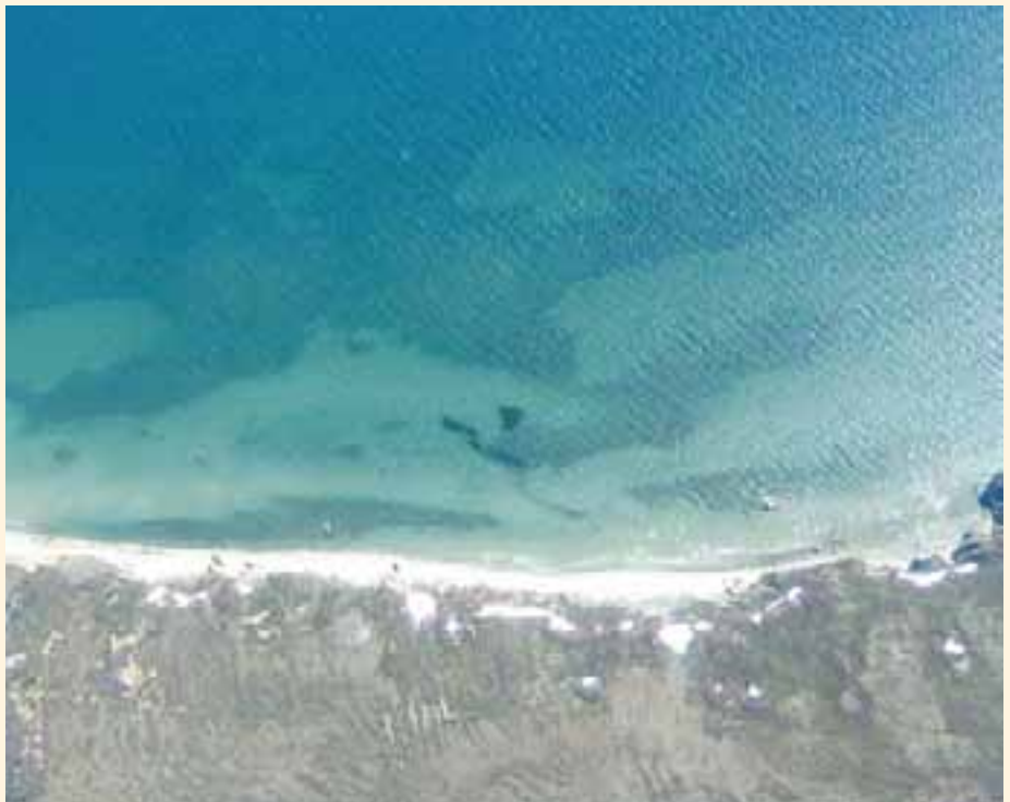
NSFR&D conducted herring surveys in June of 2008 to assist the NSSP herring fishery. The black spots in the middle are schools of herring.

In closing, on behalf of the NSEDC Board of Directors, I would like to express my appreciation for the hard work and dedication of our staff. Staff, under the guidance of our newly appointed chief executive, are the doers of the organization and make it possible for the Board to deliver our programs throughout the Norton Sound region. Thank you also to our harvesting partners, and most importantly, to the residents of our member communities for your input and consistent support. We look forward to further contributing to and enhancing the economic growth of the Norton Sound region as well as the promising future before us.