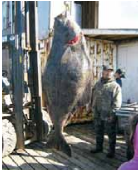
Savoonga fishermen bring these huge halibut in using open skiffs. In 2008 they delivered 23,976 pounds to the Savoonga plant.

Eight fishermen participated in the 2008 winter crab fishery. 12,293 pounds were delivered. The total paid to fishermen was $36,899.