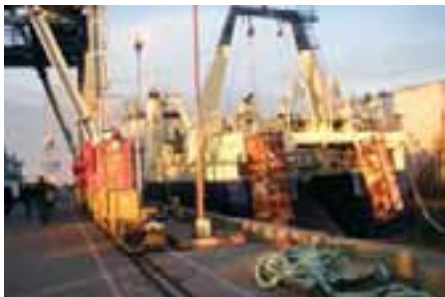
In February 2008, the F/T Pacific Glacier suffered a devastating fire. Thankfully there were no serious injuries but the fire caused $20 million in damages.

During the pollock fishery in February, Glacier Fish Company suffered a devastating fire on the F/T Pacific Glacier . The fire raged for 12 hours but was successfully contained due to crew training and preparedness, as well as the on-scene assistance from many other pollock fishing vessels and firefighting crews. No one was seriously injured but the fire caused $20 million in damages. The vessel returned to Seattle and spent the remainder of the year in the shipyard. Insurance covered the majority of the financial costs. Taking advantage of the situation, vessel and equipment improvements were made.