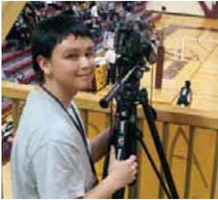
Students from the Bering Straits School District did live broadcasts from several sporting events with funds donated through NSEDC's 2008 Outside Entity Funding.