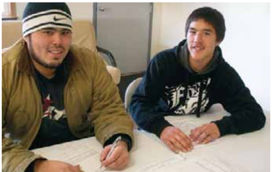
In 2008 the NSEDC Board approved a one-time $500 energy subsidy to all qualifying Norton Sound households. In total $1,184,000 was paid to 2,368 electric utility accounts.

The Board of Directors is confident that this program helped ease the immediate burden of rising energy costs affecting the region, but acknowledged that this is a one-time subsidy and a short-term solution and directed staff to examine long-term solutions.