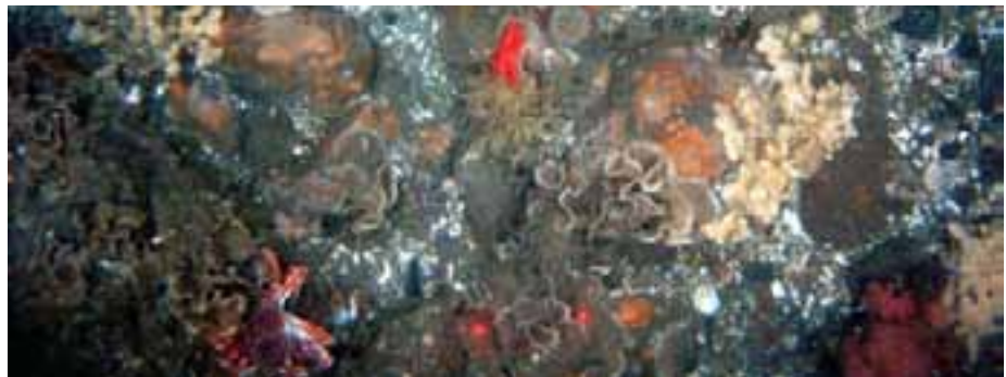
In 2008 the R/V Pandalaus , armed with a new camera sled, aided ADF&G and NSFR&D with the triennial Norton Sound red king crab survey. Photo transects may provide important information on the status and habitat of the opilio crab in northern Bering Sea. (see article on page 4)

NSEDC harvested approximately half of its bairdi allocation in 2008. A large biomass of almost legal-sized crab was present during the fishery which bodes well for future years but made it tough for crabbers to land their quotas without sorting through a lot of sublegal crab.