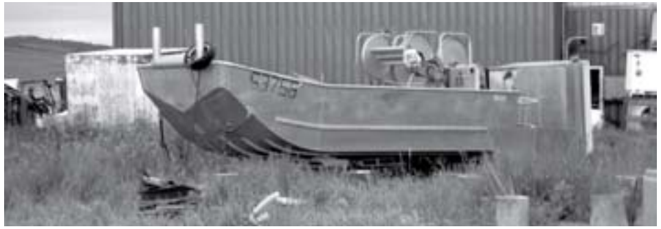
Norton Sound Herring Vessel

So to answer the question pondered at the beginning of this article, the Japanese people have found different foods to celebrate their holidays and only a few traditional families continue to buy herring roe, only now it is at a much reduced price. The distance of Norton Sound from Japan or the closeness of Bristol Bay and the Gulf of Alaska herring has caused the processors to focus their work to the south of us. Norton Sound herring remain the greatest potential fishery stock in our region. This stock may be the second largest herring stock in the entire Pacific Ocean! Finding a buyer for our herring requires finding a buyer