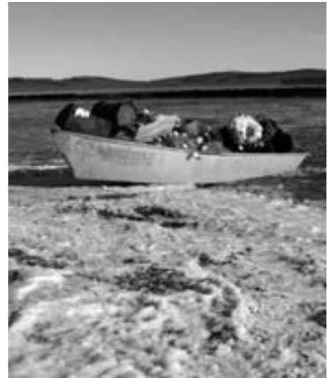
This was the last boat load of the season. The boat was removed from the flood plain in Unalakleet.

in 2008. This coming summer, clean ups will be conducted near three to five villages. Locations of the 2008 clean up will be announced at a later date. Staff will be working with the NSEDC liaisons in each community to hire crews.