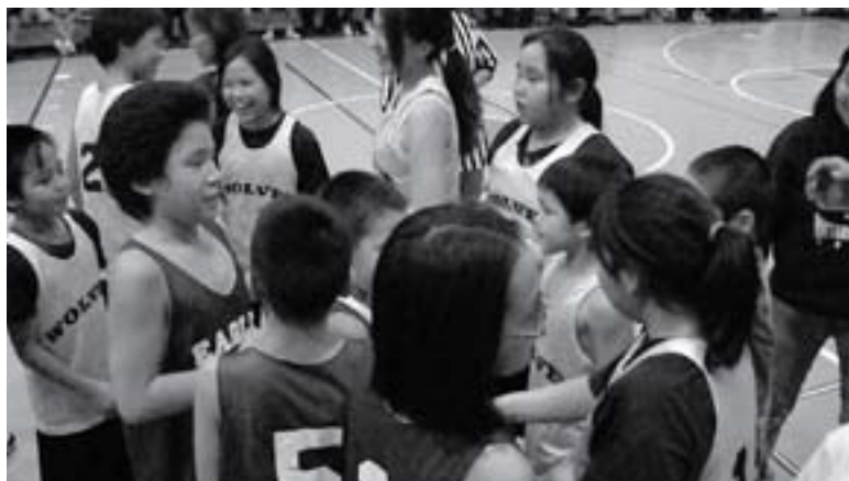
Wolf Pups and Eagles post-game congratulations