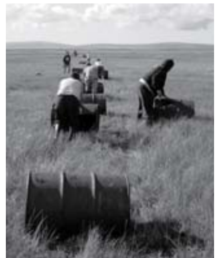
Mary Charles, Sally Agloinga, Gerald Asbenfelter, Colin Lincoln, Sara Morris, Douglas Lincoln, and Mary Kowchew form a rolling a drum train near White Mountain.

The White Mountain clean up took place from July 30th to August 31st and November 20th and 21st. Debris was removed from camps along the Fish River flood plain. A total of 51,000 pounds of debris were removed, this included 542 55-gallon drums. Other debris was removed from the Fish River and associated flood plain, with a total of 64 boat loads. In August, drums were stacked onto logs for easy removal after