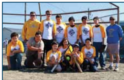
Youth softball is among the many programs NSEDC sponsors. Pictured is NSEDC's 2011 team in Nome.