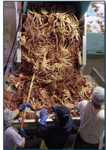
Workers at the Norton Sound Seafood Center in Nome keep pace with the deluge of crab that fishermen delivered during the shortest season in the plant's history.

In 2011 NSEDC continued to develop its unique winter commercial fishing opportunities, including through-the-ice fisheries for red king crab and bait fish such as tom cod. The crab is sold live since the frozen harbor prevents NSEDC's seafood plant from operating at full capacity. Fishermen were paid nearly $26,000 for the sale of more than 7,300 pounds of crab.