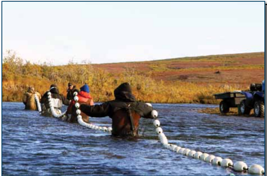
A crew from NSEDC's Fisheries Research and Development division walk a seine net across the Nome River as they prepare to catch coho salmon. The crew will capture the eggs from females and milt from the males to be used in NSEDC's mist incubation process.