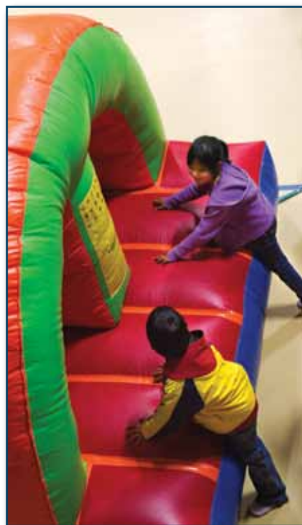
Kids in Stebbins get ready to race through the obstacle course at NSEDC's 2011 Fishermen's Fair.