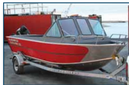
In 2011, the City of Savoonga received delivery of a rescue boat it acquired through NSEDC's 2010 fishery-related grant program.