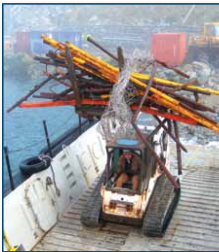
Debris from Little Diomedes are loaded on the NSEDC tender Egavik as part of NSEDC's Clean Waters marine debris cleanup program.