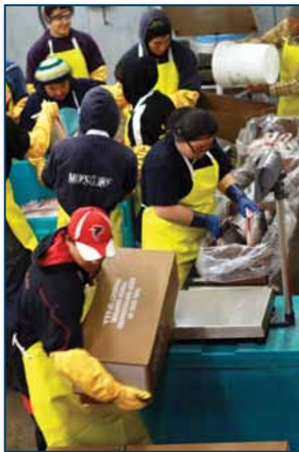
NSEDC works to spread employment opportunities throughout the region. One program covers costs for residents who live outside of Nome or Unalakleet to spend the summer working at either community's seafood plant. The Unalakleet plant is pictured above.

A breakdown of wages and employment categories supported by NSEDC