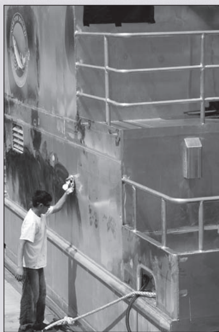
Tender Vessel Crew