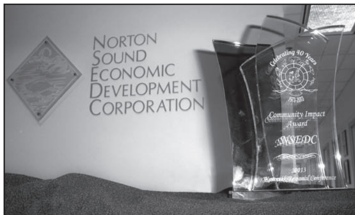
NSEDC is proud and honored to have been awarded Kawerak's Community Impact Award during the 2013 Regional Conference in Nome.

NSEDC is currently accepting applications for the 2013 Small Businesses Initiative. More information on the Small Business Initiative and the many other programs offered by NSEDC can be found at www.nsedc.com .