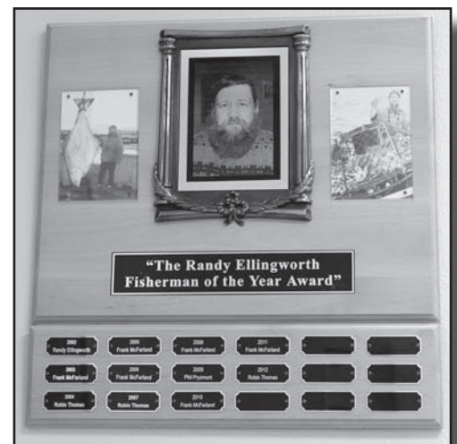
The Randy Ellingworth Fisherman of the Year Award is on display again at the Norton Sound Seafood Center in Nome.

NSED and NSSP hope the Randy Ellingworth Award and trophy will serve as an incentive for the fishermen who have a long-standing history of delivering to NSSP, as well as those who are up and coming in the fisheries. We congratulate all our fishermen for their past successes and wish them good fishing as we look to the seasons ahead.