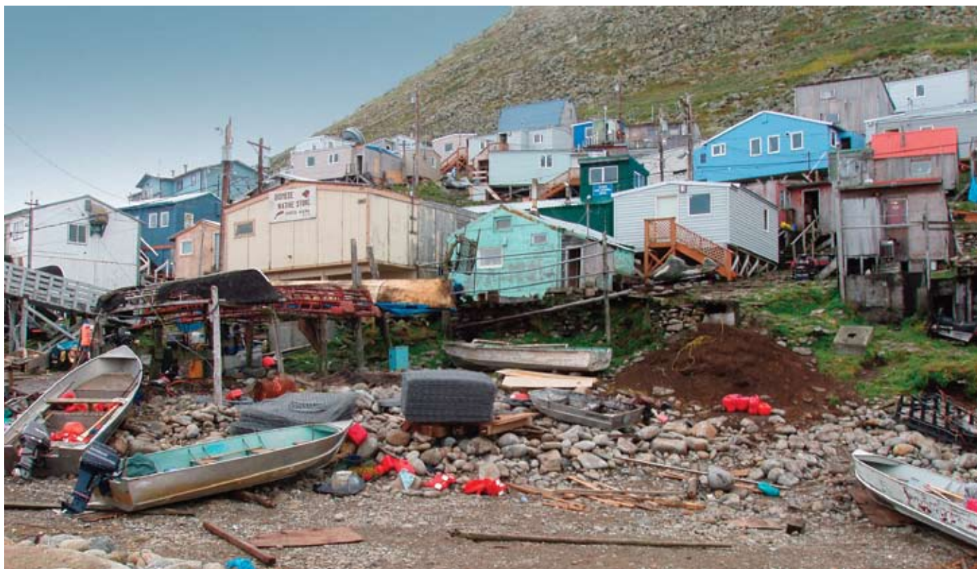
Diomedes, Alaska taken on NSEDC's Community Outreach trip in August 2004

with NSEDC's CDQ partners, other factory trawler companies, and seafood processing positions on-land or at-sea. In 2004, 34 residents from NSEDC member and surrounding communities completed the course and became certified seafood processors. NSEDC has also sponsored Marine Navigation & Vessel Safety Training, Salmon & Roe Technician Training, and Six-pack Vessel License Training.