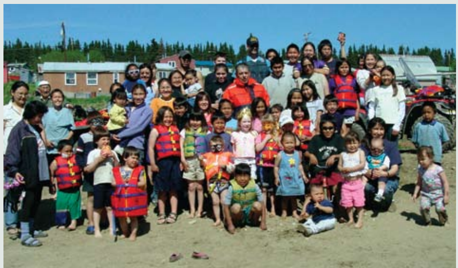
White Mountain residents at a safety fair funded through the 2003 Community Benefit Share

Purchase sewing machines for use in the school evening programs and to purchase rock fill and gravel/sand, rent heavy equipment, and pay laborers to build two outdoor recreation areas – a basketball court and baseball field.