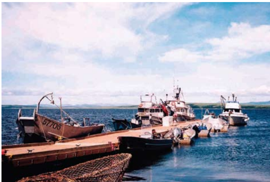
Boats docked at the Golovin Floating Dock purchased by NSEDC