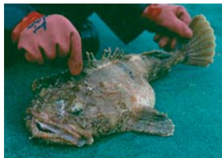
Bigmouth Sculpin, a longliner bycatch

The 2005-2006 season was the first for a CDQ fishery for golden king crab (also called brown crab) in the eastern Aleutian Islands. The CDQ program