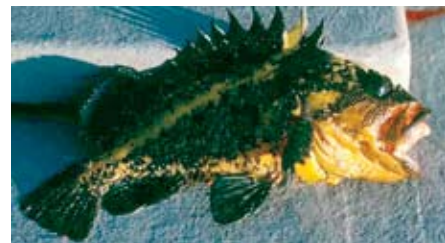
China Rockfish, a bycatch on longliners

Bering Sea and Aleutian Islands were too small to conduct directed fisheries and were therefore reserved for bycatch only in other target fisheries.