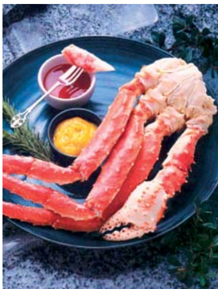
Norton Sound Crab

There was no commercial fishery for king crab in the Pribilof Islands and at St. Matthew and for bairdi crab in the Bering Sea due to continued crab stock conditions under the harvest threshold.