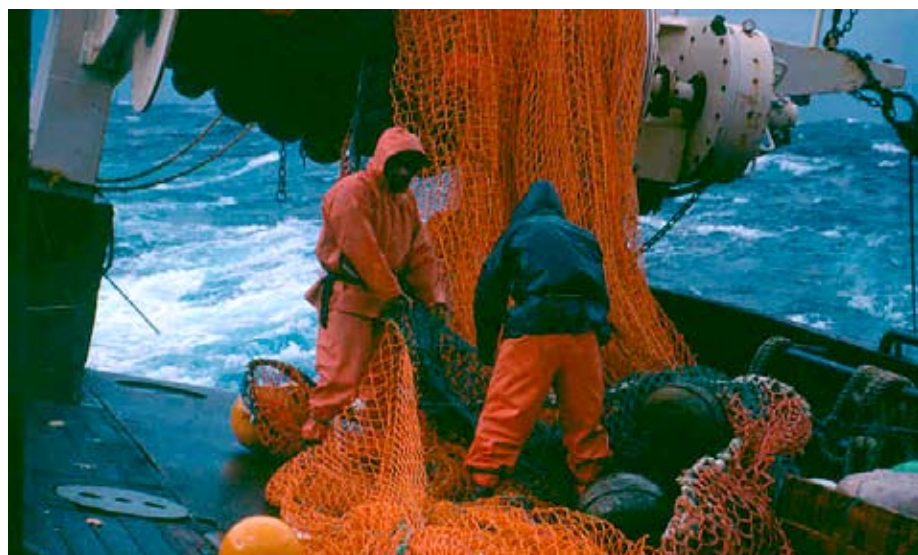
Deck hands tying off a Codend on a trawler harvesting Atka Mackerel in the Aleutian Islands

NSEDC also worked with USS in 2005 to increase the harvest of other CDQ