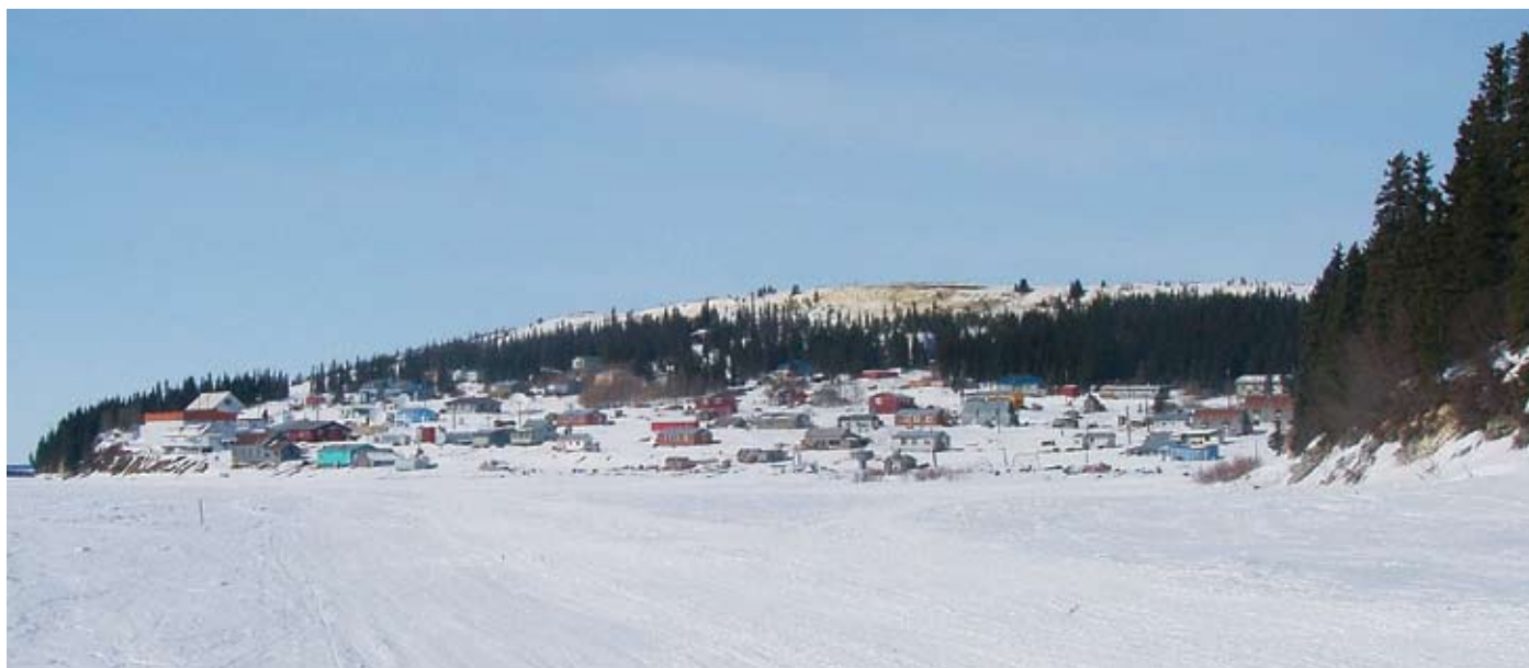
The community of White Mountain