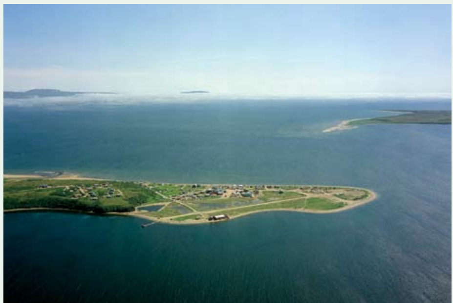
Aerial view of Golovin