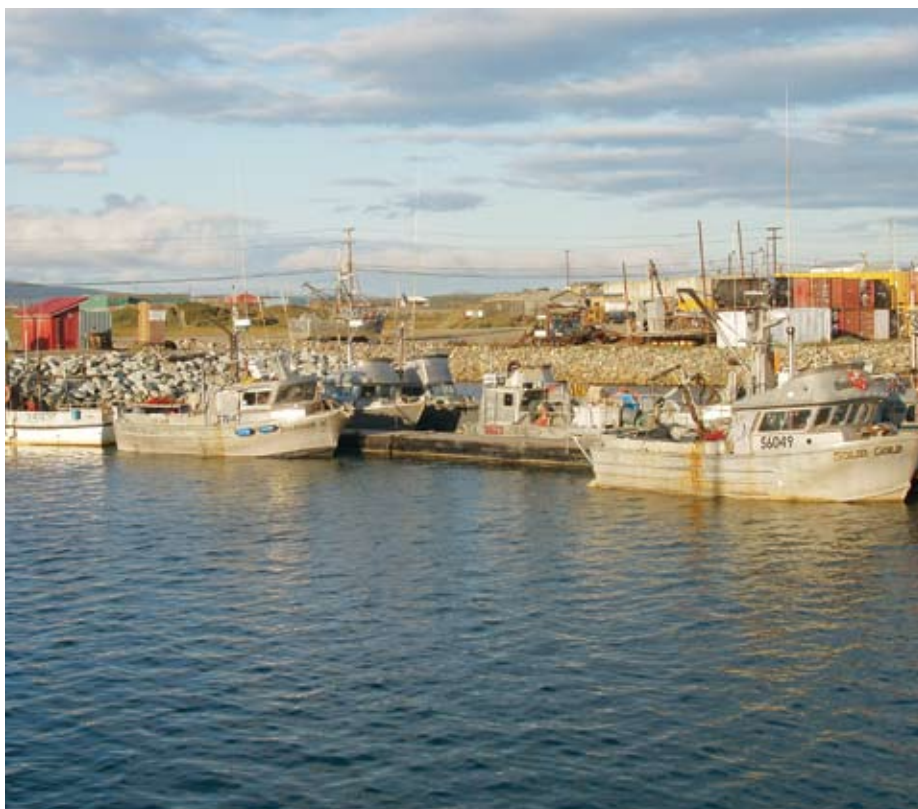
Boats lined up at the Nome Small Boat Harbor