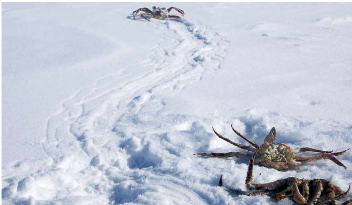
Norton Sound Red King Crab caught during the winter fishery.

A master mate/OUPV class was held in Nome in May with twelve residents with a cost of $18,283.47. Mitch Demientieff of Nome went to refrigeration training at the Refrigeration School, Inc. in Phoenix, Arizona for $14,518.30. In all, the training opportunities provided by NSEDC totalled $140,284.70 for the year.