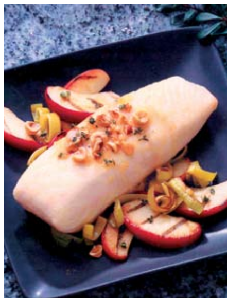
Norton Sound Halibut