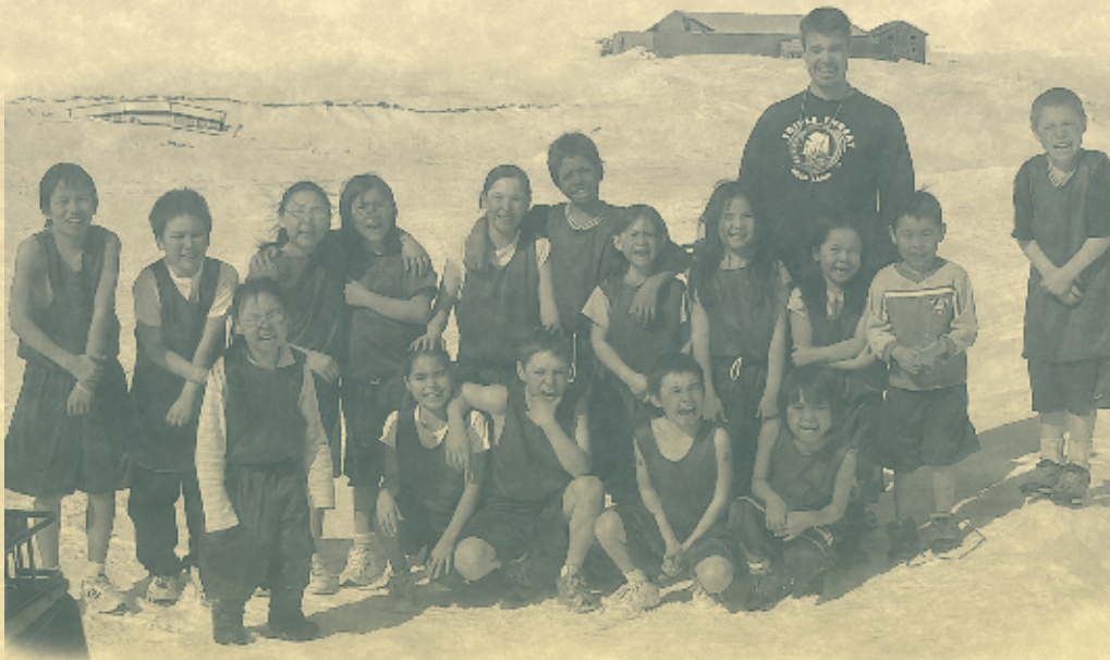
Participants of the Martin L. Olson Healthy Activities Basketball Camp funded through the NSEDCC Alcohol and Substance Abuse Prevention Program.

NSEDCC was originally incorporated in 1989 for the purpose of promoting economic development primarily for the Norton Sound area. In 1992, NSEDCC restructured to become eligible as an applicant representing the Norton Sound region in the CDQ Program. NSEDCC was successful in this endeavor, receiving 20% of the initial allocation of Pollock to the CDQ Program (7.5% of the Total Allowable Catch or TAC). Subsequent allocations received by NSEDCC were 22% in 1995-1999 (at which point the American Fisheries Act was enacted increasing the CDQ reserves of pollock to 10% of the TAC), and 23% in 2000-2002. In the latest allocation cycle, 2003-2005, NSEDCC received a 22% CDQ allocation of pollock.