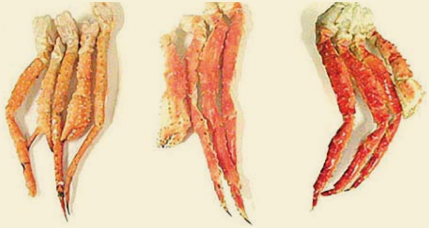
Brown (also known as golden), Blue and Red King Crab.

NSEDC worked with the catch-processing vessel F/V Baranof , and the catcher vessels F/V Ocean Olympic and F/V North Sea to harvest the entire 2006/07 quota of 658,188 pounds of CDQ opilio crab. The Baranof is an at-sea catcher/processor which by regulation can take only 75% of the allocation in any CDQ crab fishery with the remaining 25% required to be delivered to and processed by a shoreside plant. This