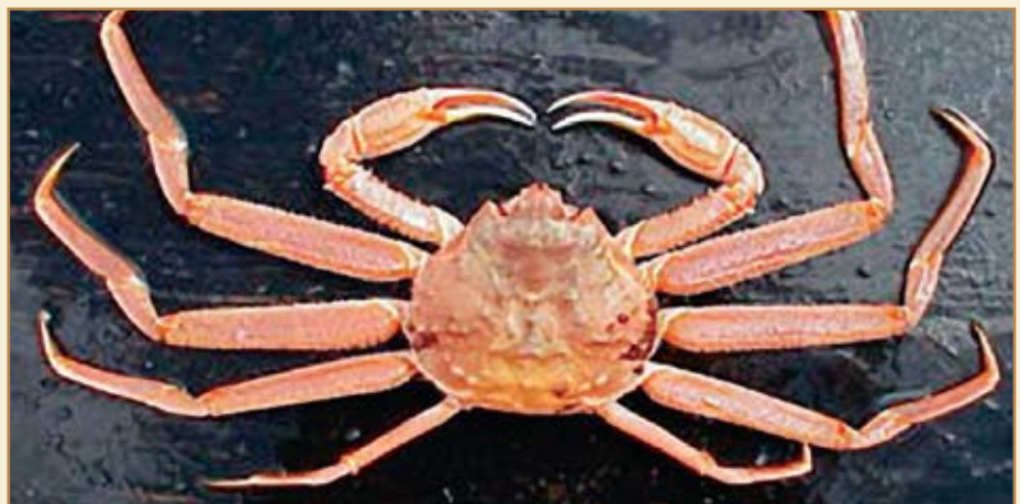
Opilio Crab (Chionoecetes bairdi)

NSEDC harvested the entire amount of the 2006/07 allocation of CDQ bairdi crab or 33,750 pounds in the eastern district and 19,692 pounds in the western district using the F/V Baranof and the F/V Tempo Sea . This quota was harvested in a timeframe from December 2006 to April 2007.