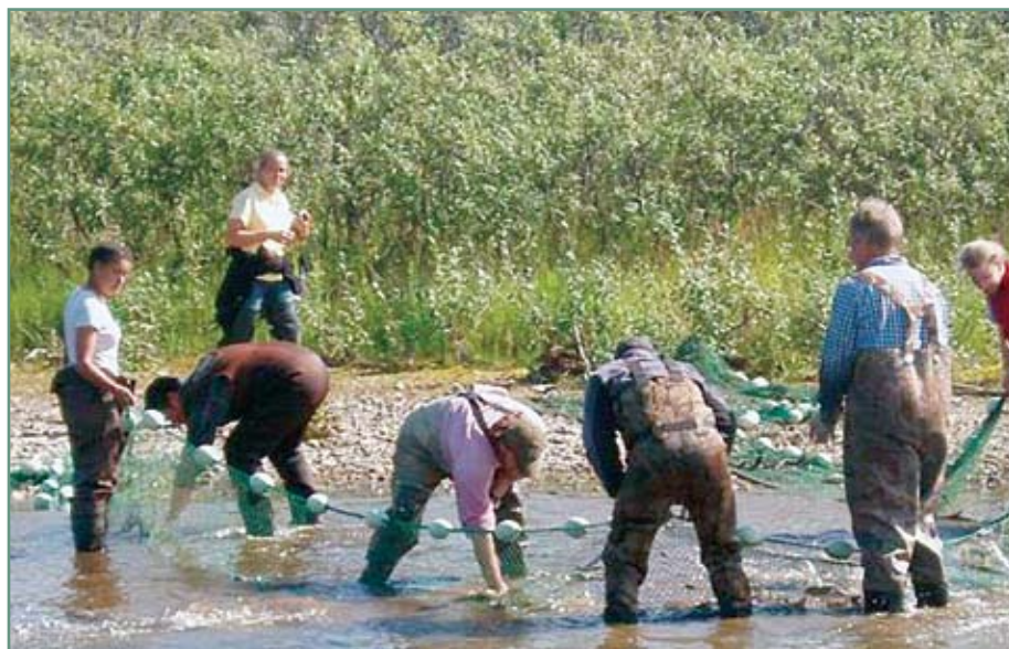
Trying to find the best fish for egg takes

During the last five years, the sockeye salmon returns to Salmon Lake have blossomed. Unfortunately the size of sockeye smolt leaving the lake has declined to the levels seen over ten years