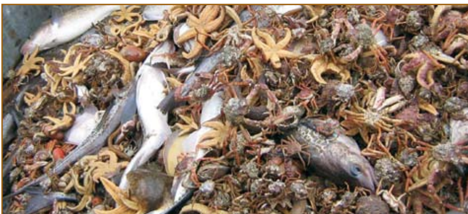
2006 Northern Bering Sea Trawl Survey – catch at one of the stations

NSFR&D also continued work with LGL Alaska Research Associates Alaska on Nome River juvenile coho studies. We're looking at how juvenile salmon utilize habitat, how many fish are actually needed to provide stable returns, and how well salmon survive in their time at sea. We are planning to expand this project to other river systems in the near future to provide for better management of coho stocks around the region.