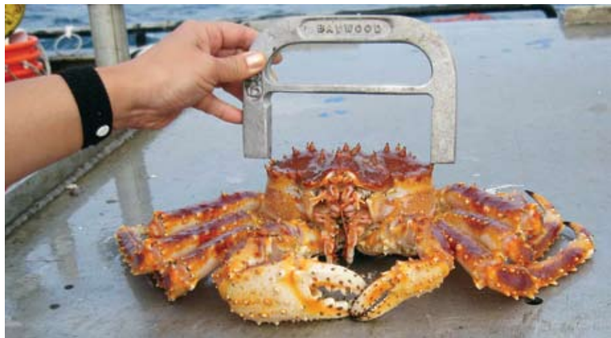
2006 Northern Bering Sea Trawl Survey – 5.5 inch blue king crab

In April, NSEDC acquired the research vessel Pandalus from ADF&G. Under a cooperative agreement with ADF&G the vessel was brought to Norton Sound in July to conduct two trawl surveys. ADF&G conducted the Triennial Norton Sound Red King Crab Trawl