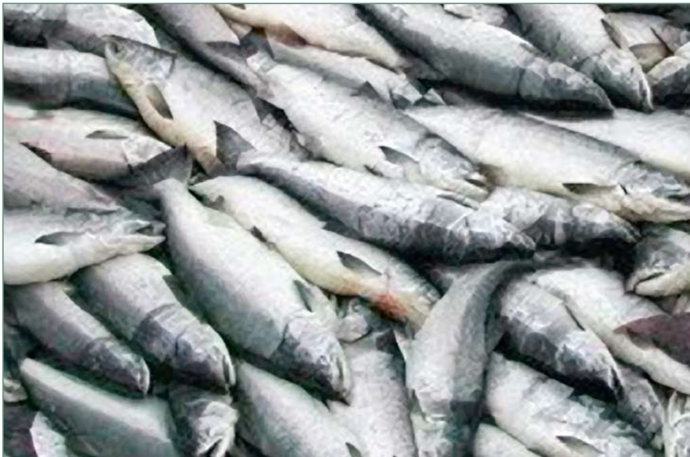
Salmon delivered to the Unalakleet Plant

The open-access crab season commenced July 1st and closed August 22nd. Twenty-seven fishermen delivered a total harvest of 379,000 pounds. The ex-vessel value totaled $945,913. Fishermen were paid an average of $35,034 each.