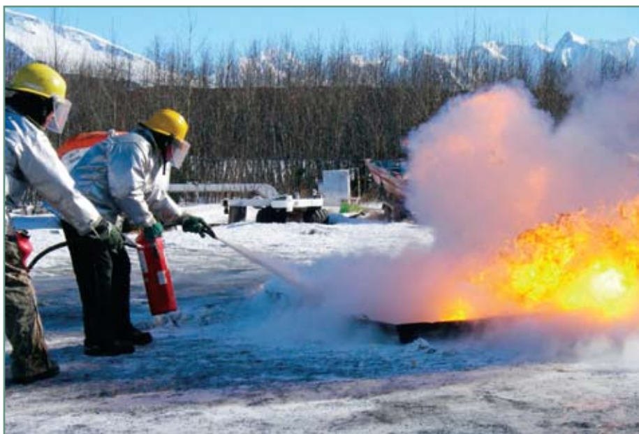
Fire Training, part of the Fisheries Safety Orientation Class held at AVTEC in Seward, Alaska