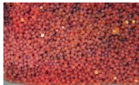
Salmon eggs procured for the Mist Incubation Project

We met our egg take goals for chum and coho in 2006. The mist incubation portion of the project ran much more smoothly than in previous years and survival was high for both chum and coho (mortality less than ten percent in both cases). We got good reviews on