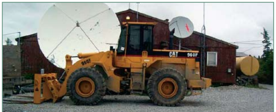
Front end loader purchased in lieu of boat ramp for Koyuk