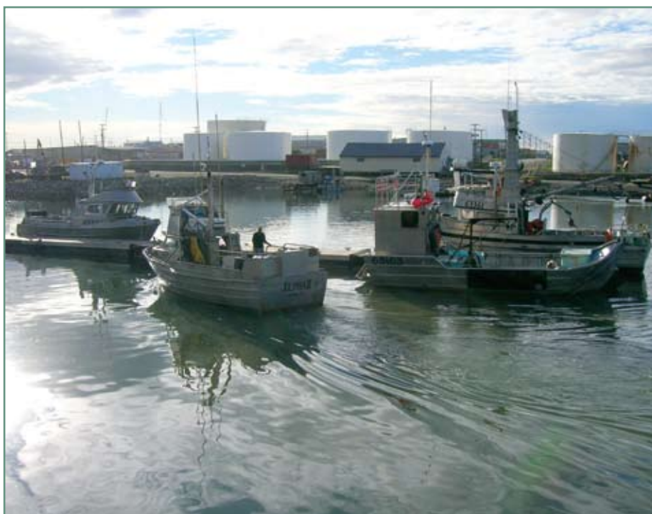
Boats docking at the Nome Small Boat Harbor

In 2006, NSEDC made four Large Vessel Loans in the sum of $168,875.64 to local commercial fishermen of Elim, Nome and Shaktoolik.