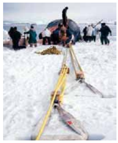
Savoonga block and tackle purchased through an Outside Entity Funding grant.

The construction of the Cold Storage Facility upgrades at NSSC in Nome commenced in summer 2007. LCMF, Inc. is the Architectural & Engineering Firm and Alaska Mechanical, Inc. is the General Contractor. The construction will replace the existing cold storage system of portable freezer vans that the NSSC currently uses with a permanent structure that will have freezer rooms capable of holding 175,000 pounds of palletized and racked crab, halibut, salmon, cod and other product, to maximize efficiency. The facility will be constructed on a