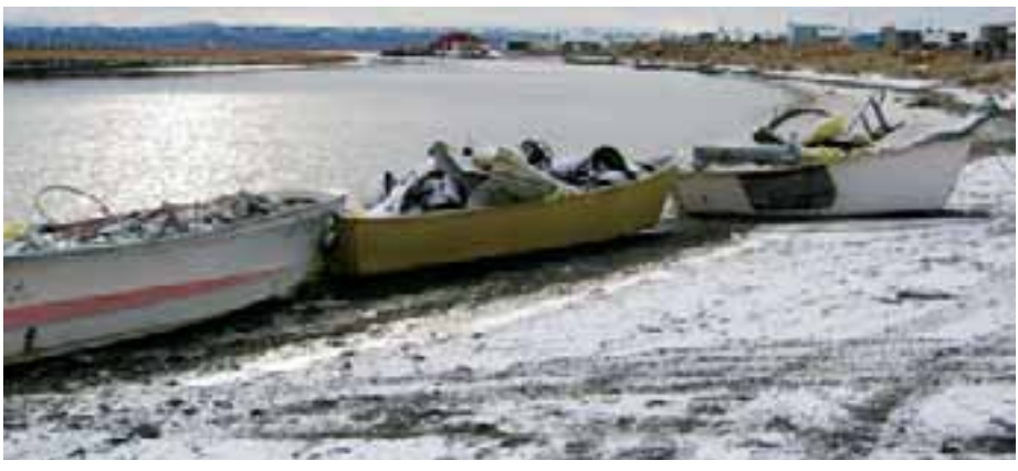
Boat loads of debris were taken along the shoreline of Unalakleet through the Clean Waters Program.

The Clean Waters Program is another program that NSFR&D has shown leadership in. The success of the 2006 clean-up brought recognition for the program and we were requested to fly the entire coast of the Alaska Bering Sea to inventory the extent of marine debris in 2007. Local site clean-ups were completed in Shaktoolik, Unalakleet, and White Mountain. The total weight of