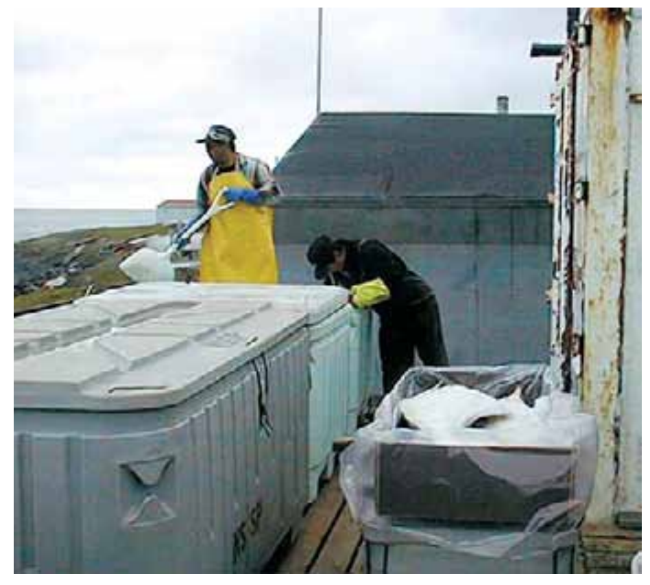
Savoonga plant workers icing halibut and preparing totes for shipping to Nome.

provide technical support and knowledge to local fishermen on product quality, the use of longline fishing gear, the regulatory process and oversight of the halibut fishery by the IPHC, National Marine Fisheries Service, Alaska Department of Fish & Game, and the new CDQ halibut management systems.