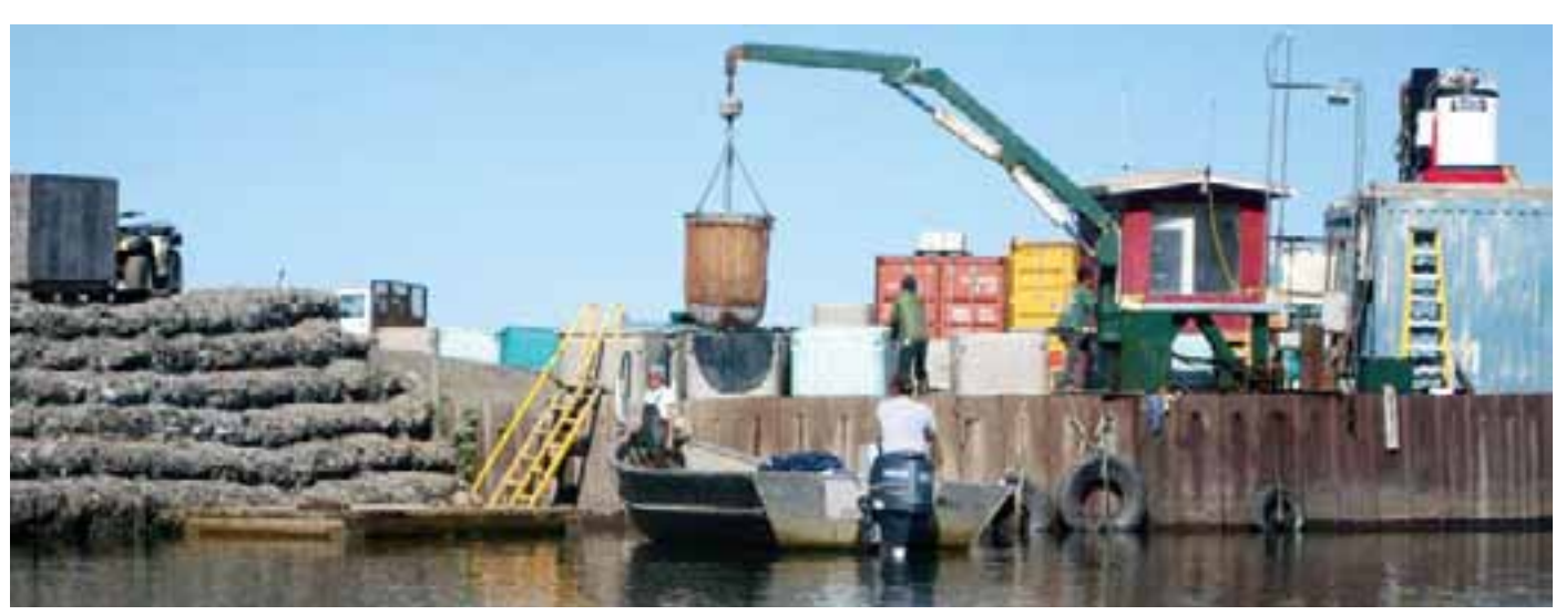
Salmon being offloaded at the Norton Sound Seafood Unalakleet processing plant.

Altogether fishermen were paid a total of $651,829.70 for salmon, with the majority of the income coming from coho salmon.