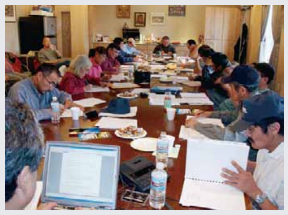
NSEDC Board of Directors hard at work at the 2007 3rd quarter meetings.