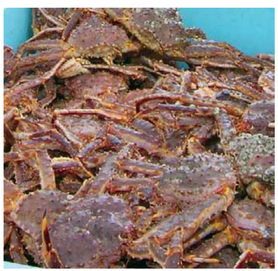
Norton Sound Red King Crab

NSEDC harvested 23,611 pounds of CDQ red king crab in Norton Sound during the second quarter working with eight local fishing boats delivering to the NSSC in Nome. Only 14 pounds of the combined NSEDC and Yukon Delta allocation was not harvested.