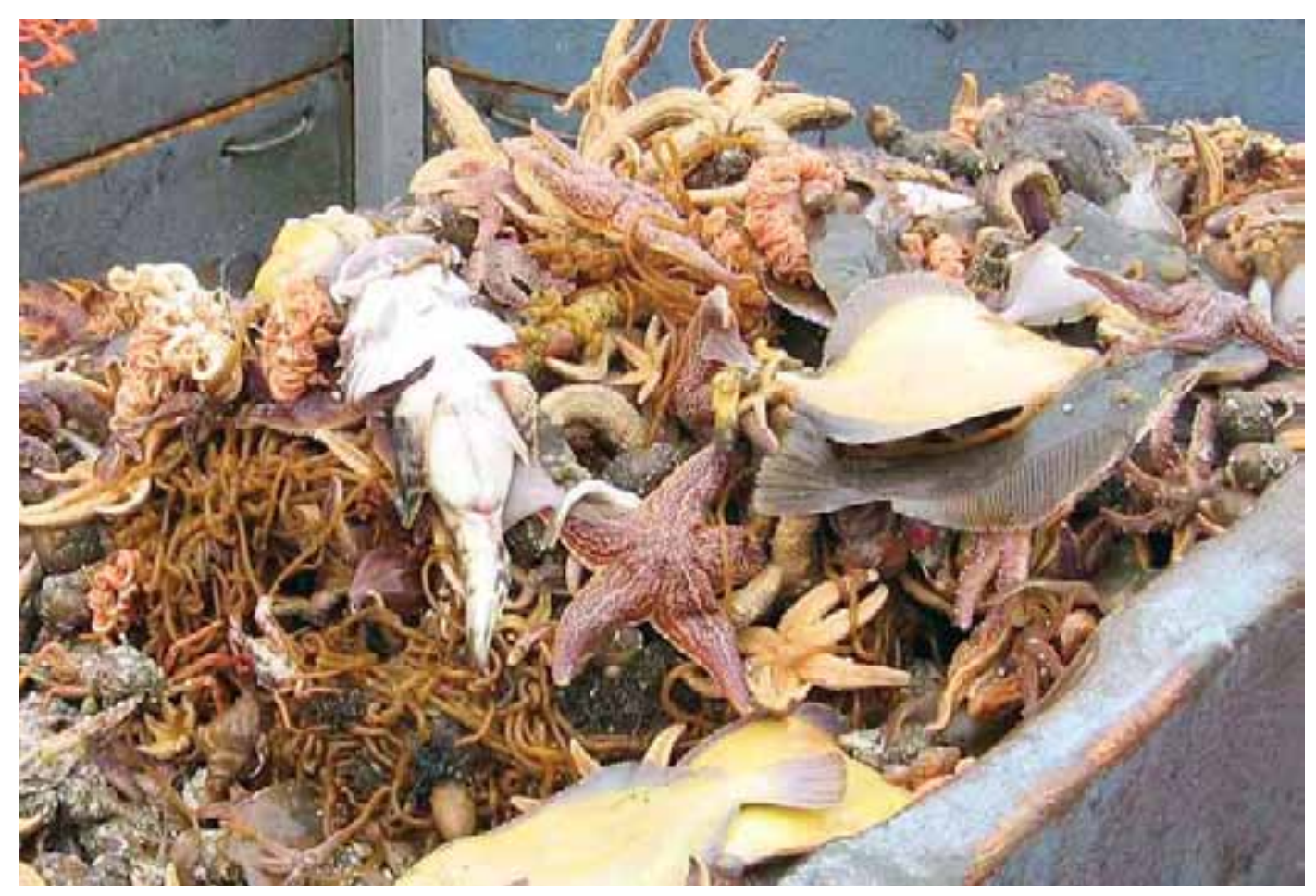
This picture shows an example of sealife found in the Bering Sea during an R/V Pandalaus survey.

The CDQ harvest in bottom-trawl fisheries for Atka mackerel/POP, yellowfin sole and rock sole accounted for almost 2% of all CDQ royalties. NSEDC harvested the entire CDQ allocation of Atka mackerel (661 tons) and POP (186 tons), as wells as a small amount of quota transferred to NSEDC from another CDQ group. USS