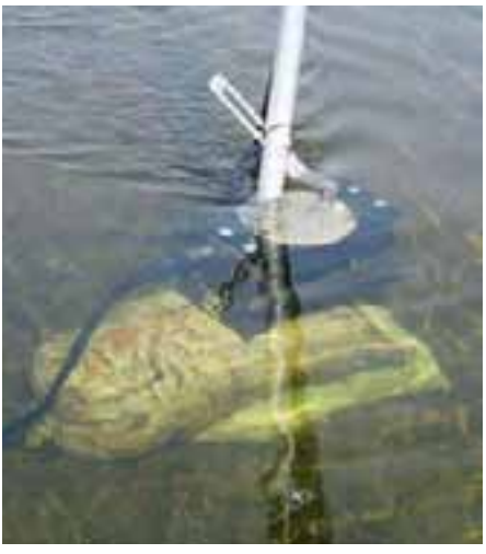
Didson sonar at work on the Shaktoolik River.

The Seward Peninsula has enjoyed much improved red salmon runs over the past decade. NSEDC has played a significant role in that improvement by fertilizing Salmon Lake to improve productivity. In 2007, NSFR&D distributed 16 tons of fertilizer in Salmon Lake and monitored plankton levels in the lake to document the effect of fertilization. NSFR&D conducted smolt research on the Pilgrim River in cooperation with the Alaska Department of Fish and Game (ADF&G) and the U.S. Geological Survey