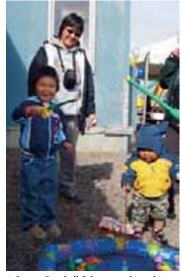
A future Gambell fisherman shows his latest catch - what a smile! July 2007